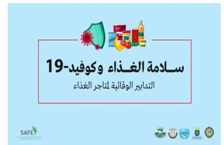
Preventive Measures in Food Production Campaigns