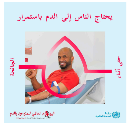
Blood Donation Campaigns