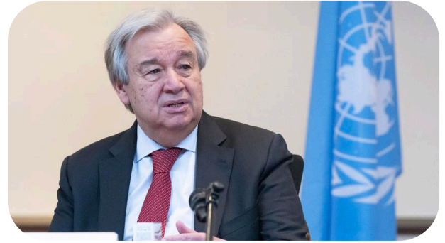
Secretary-General António Guterres "Put women and girls at the centre of efforts to recover from COVID-19"

COVID-19 pandemic is having devastating social and economic consequences on women and girls. Quarantine and isolation policies increased the vulnerability to gender-based violence (GBV), increased the unemployment rates of women, overloaded women with the burden of unpaid care in addition to limited access to health insurance and low access to health information during the pandemic. These findings are outlined in two knowledge products released by UN Women in Egypt in cooperation with the National Council of Women (NCW) and Baseera entitled "Women's Needs and Gender Equality in Egypt's COVID-19" and "Response and Women and COVID-19" to highlight major challenges and opportunities for women during the pandemic