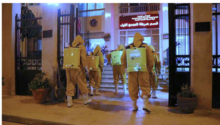
Sterilization and disinfection efforts in all police buildings and facilities in Egypt

UNODC works to ensure that children are better served and protected by justice systems and that international standards and norms are applied to safeguard the rights of children in the administration of justice. UNODC delivered an online training to officials from correctional institutions and juvenile centers in Egypt aimed at strengthening their response to COVID-19 and protecting the children and youth in these centers from the spread of the virus following international health and human rights standards. Juvenile centers and correctional institutions could face several unique challenges in preventing COVID-19, such challenges include the concern of newcomers carrying the virus to the institution or facility, the difficulty of maintaining safe physical distancing when many individuals are living and working within the same closed settings, the dependency of the children and youth on family visits for emotional and mental support which would be restricted due to limiting any external visits and the lack of group-based activities and interactions.