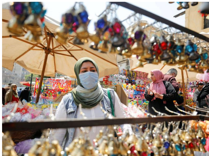
Egyptian Markets during the lockdown – April 2020