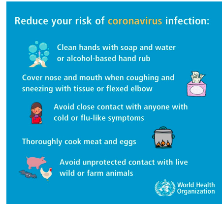
COVID-19 Information Campaigns

The videos include guidelines on adapting food safety management systems to the conditions of prevention and management of COVID-19 and in particular enhanced hygienic practices, food safety measures and physical distancing. The videos leveraged the information produced by various food safety authorities and risk assessment agencies, including the guidance developed by FAO and WHO.