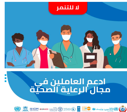
Anti-bullying for the healthcare workers Campaign