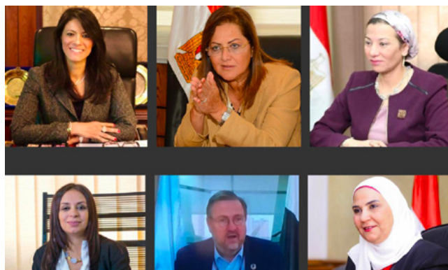
High Level Online Coordination Meeting between (from left to right) Minister of International Cooperation, Minister of Planning, Minister of Environment, President of the National Council of Women, the Resident Coordinator of the United Nations in Egypt and the Minister of Social Solidarity (April 2020)