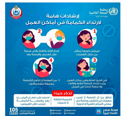
Wearing Facial Masks Campaigns