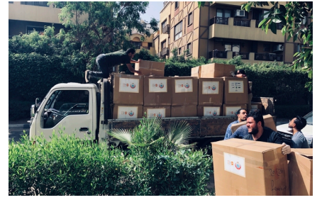
Ammar Adel, 22-year-old volunteer from Y-PEER, UNFPA's youth leadership network.

"Every morning we meet with the intention of packing as many kits as we can, to be delivered to the health workers who are working hard to protect us,"