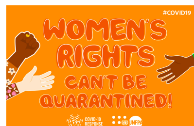
Online Campaigns of GBV during COVID-19

Funds were also redirected to support one-time cash transfers for 5,000 social and outreach workers to cope with economic impact of the COVID-19 crisis. The social workers participate in community GBV and harmful practices campaigns which are currently on hold, such as door-knocking campaigns.