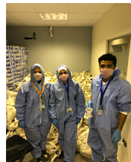
Y-PEER volunteers managed to pack 11,000 kits in 10 days.

"Every morning we meet with the intention of packing as many kits as we can, to be delivered to the health workers who are working hard to protect us,"