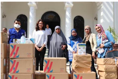
Provision of PPEs, Giza Governorate